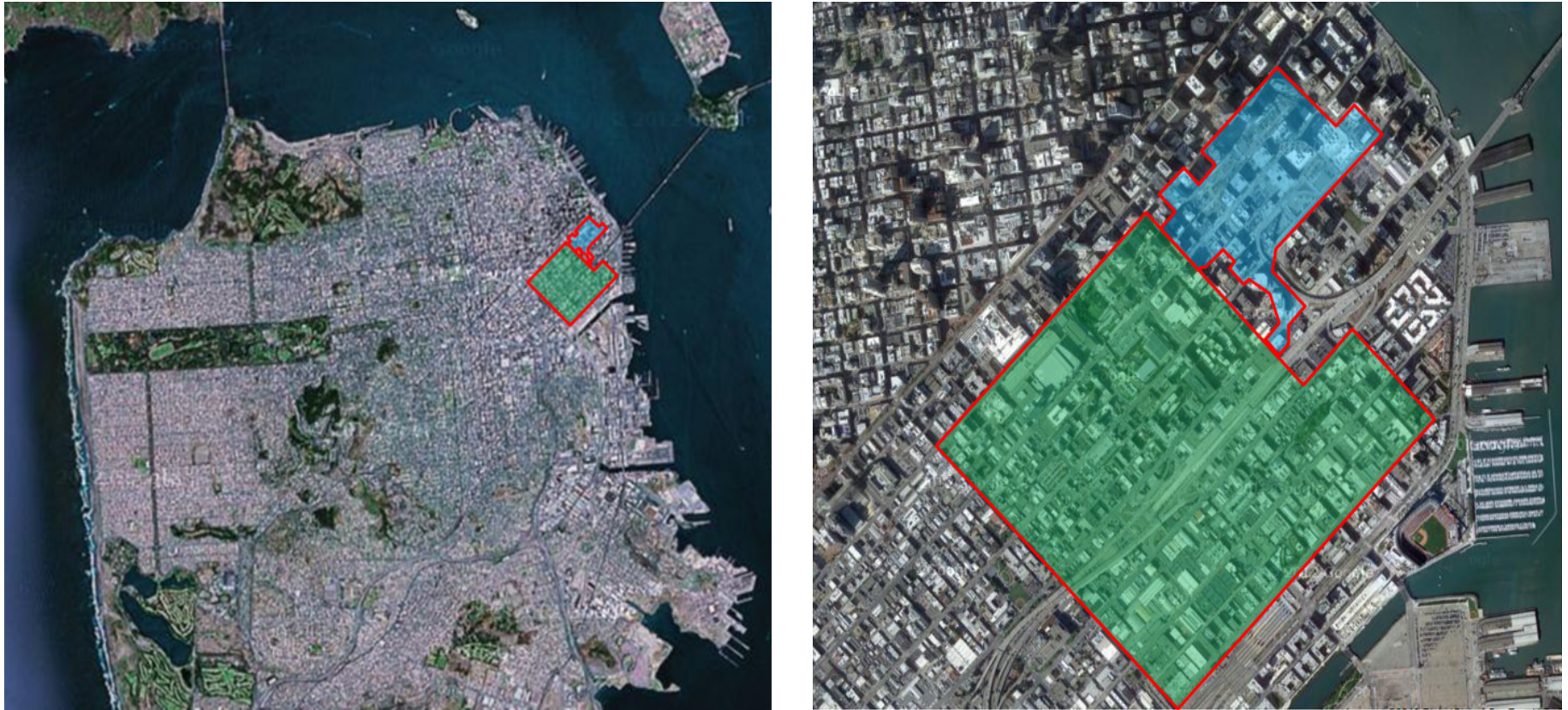
The Transbay Center (blue) and Central Corridor (green) Districts